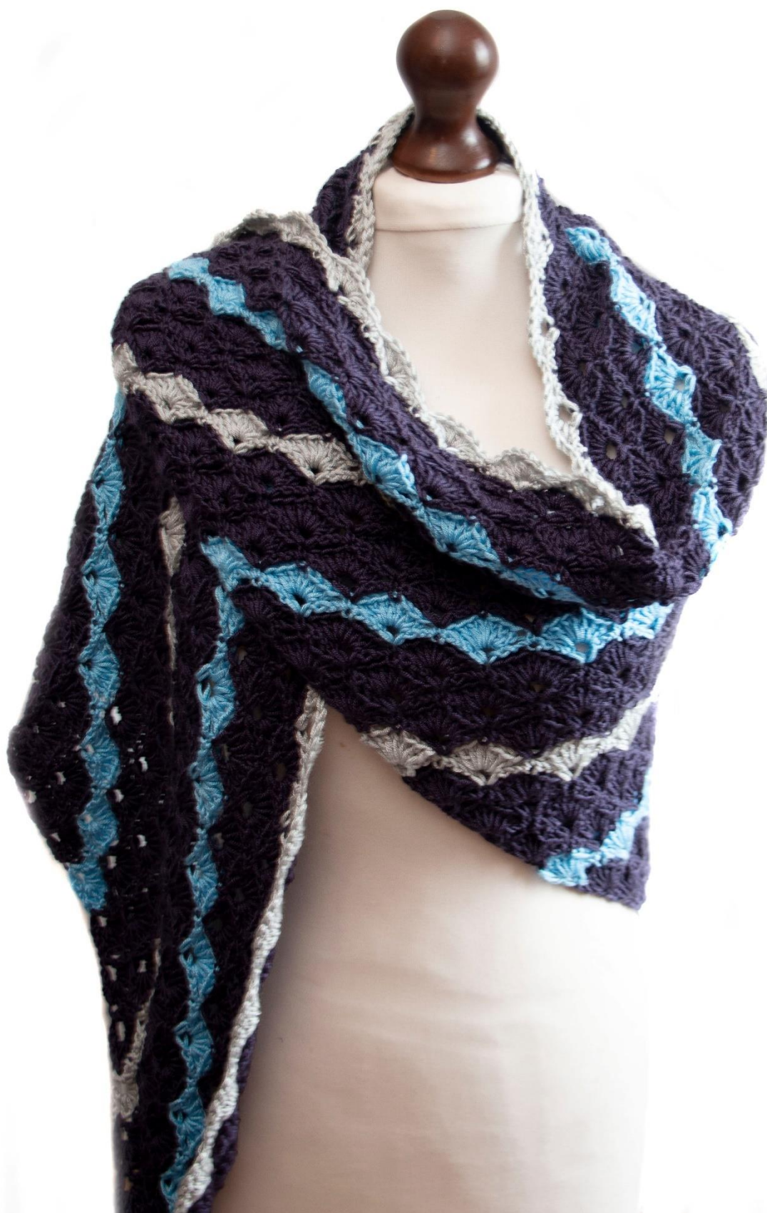
CY1357 SILCARESS DK SUMMER SHELLS SHAWL