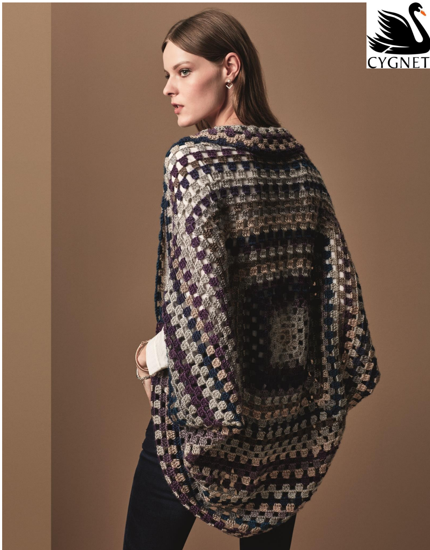
CY1276 Cygnet Boho Spirit Chic Cardigan