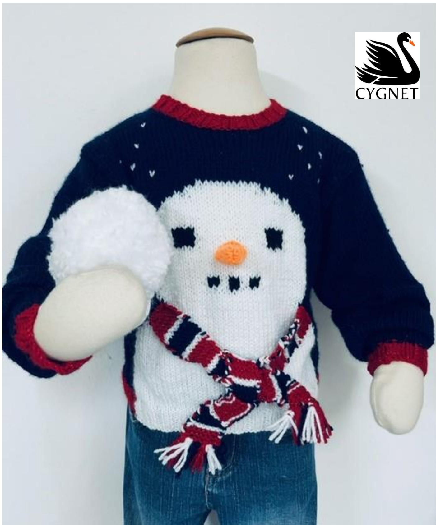
Cygnets Glittery DK Snowman Sweater CY1843