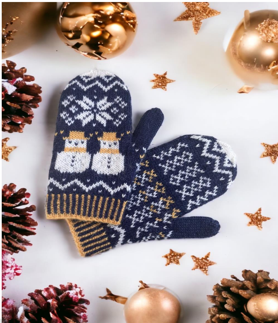
CY1780 Truly Wool Rich 4 ply Lumiukko Mittens