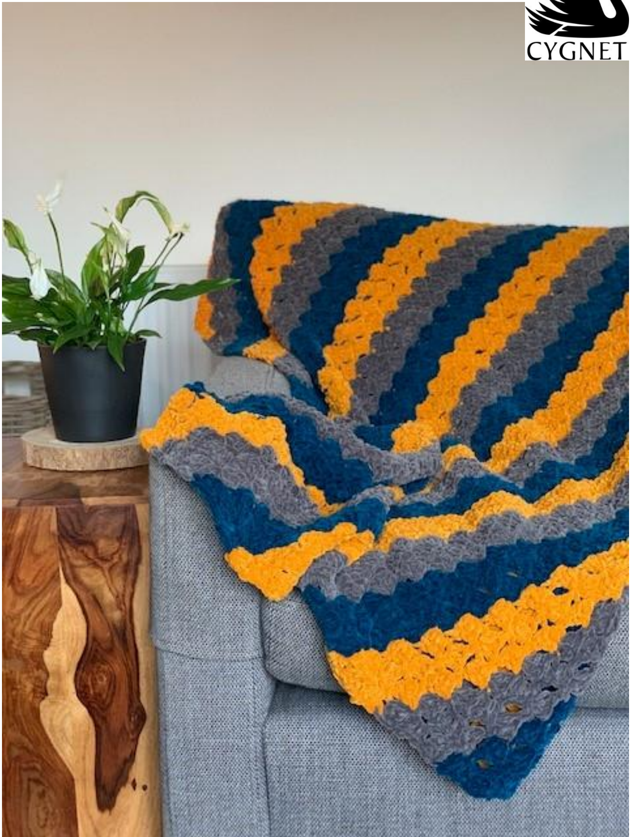
CY1244 Chenille Chunky Chenille C2C Lanzarote Beach Blanket