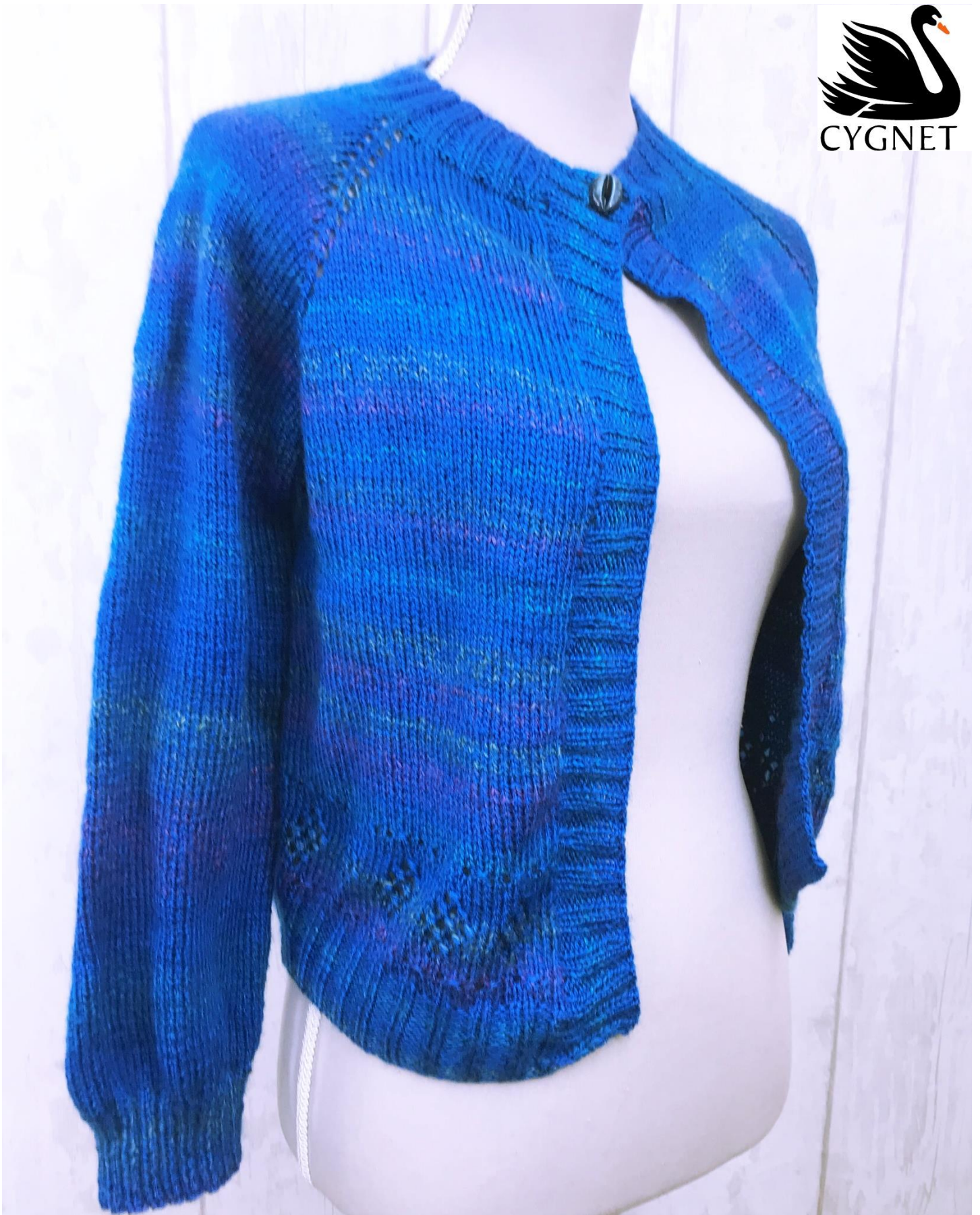
CY1176 WATERCOLOUR DK TOP DOWN LACE CARDIGAN