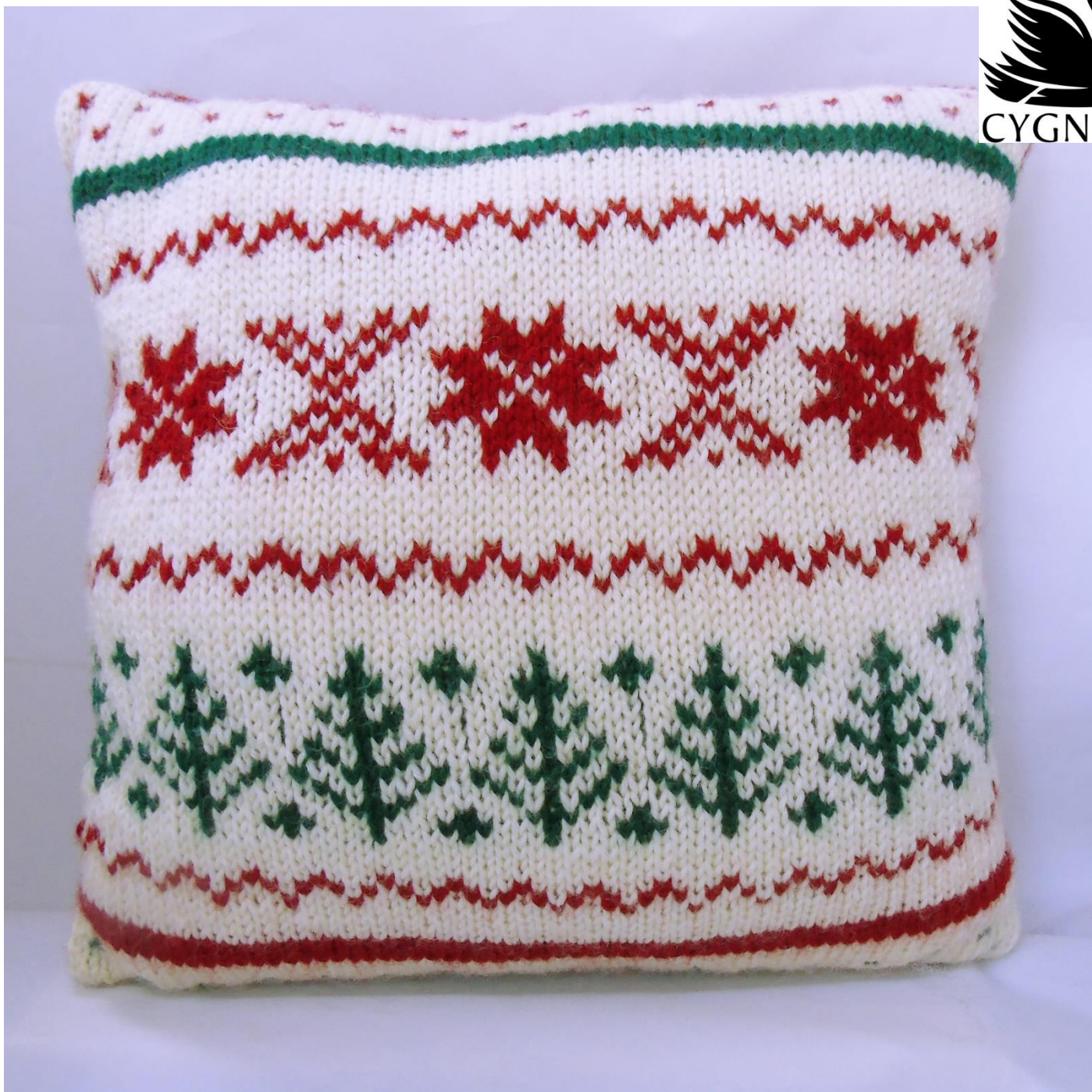
CY1270 Pure Wool Superwash DK Scandi Christmas Cushion