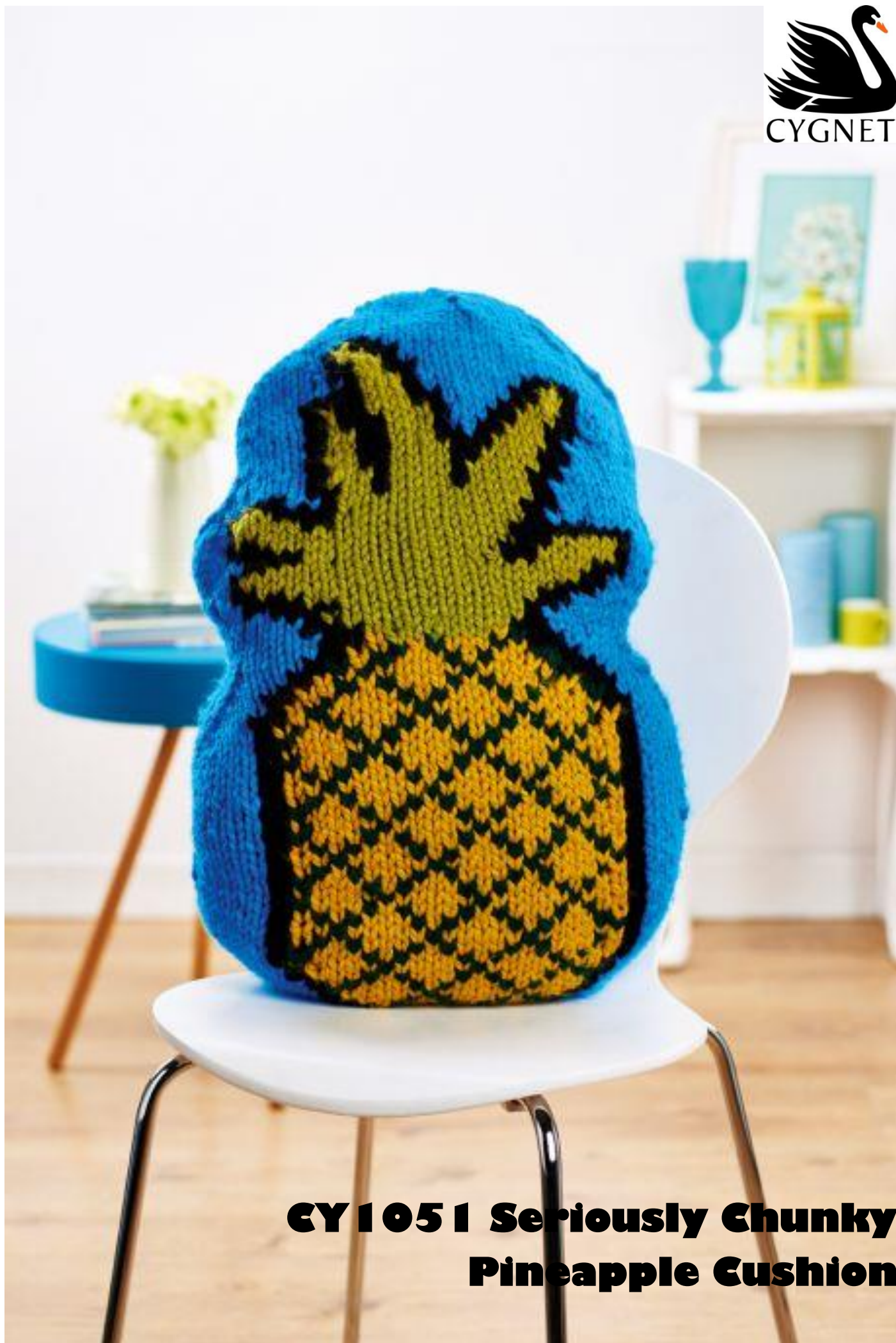
CY1051 Seriously Chunky Pineapple Cushion