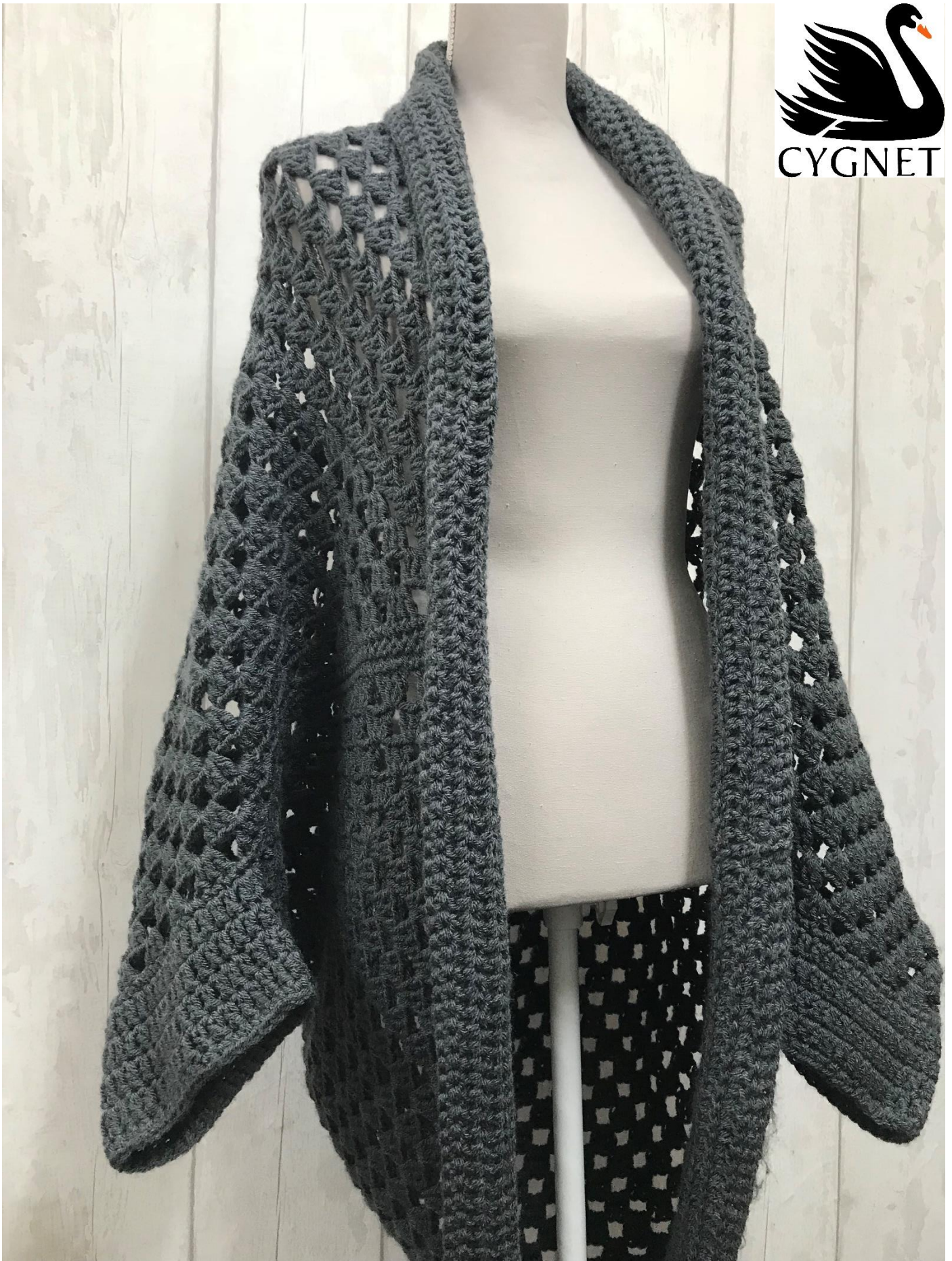
CY1030 CYGNET CHUNKY CROCHETED COCOON CARDIGAN