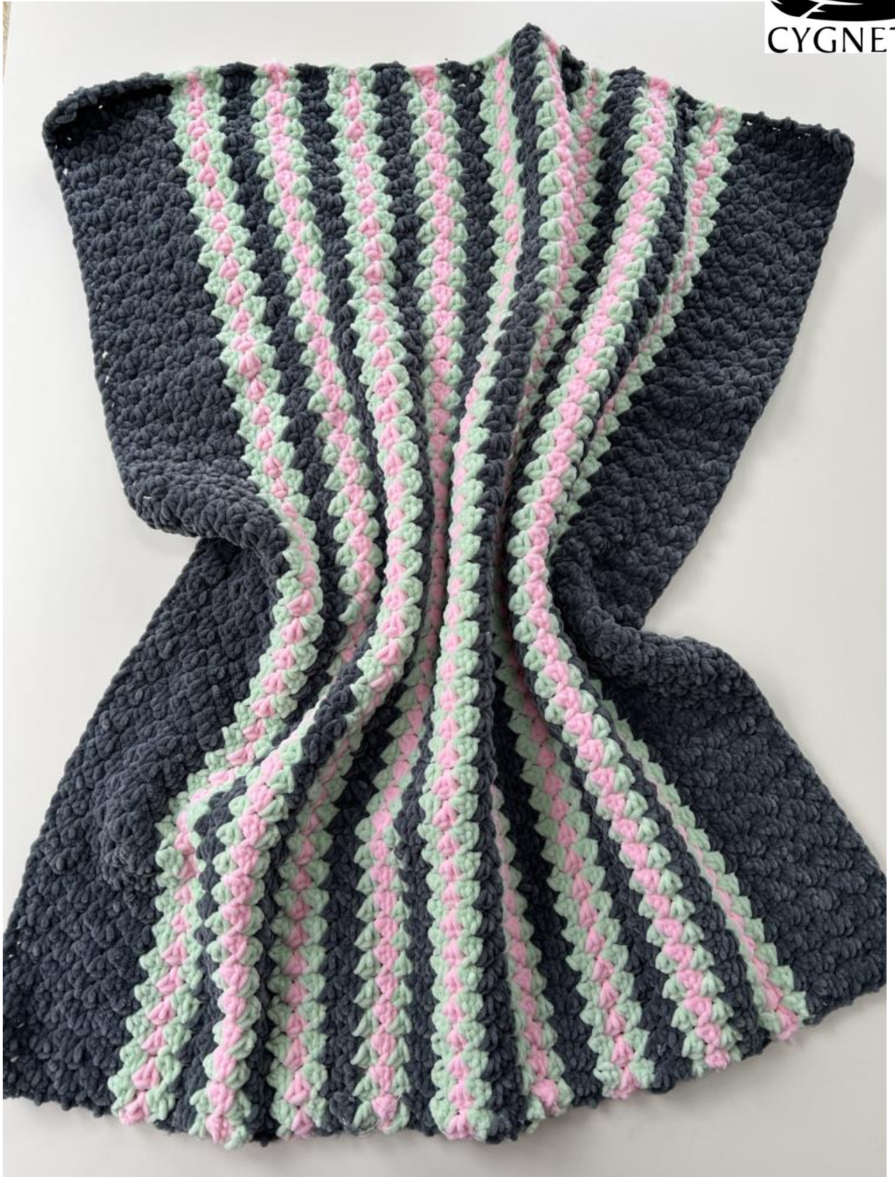
CY1517 Jellybaby Chenille Chunky Suzette Stitch Blanket