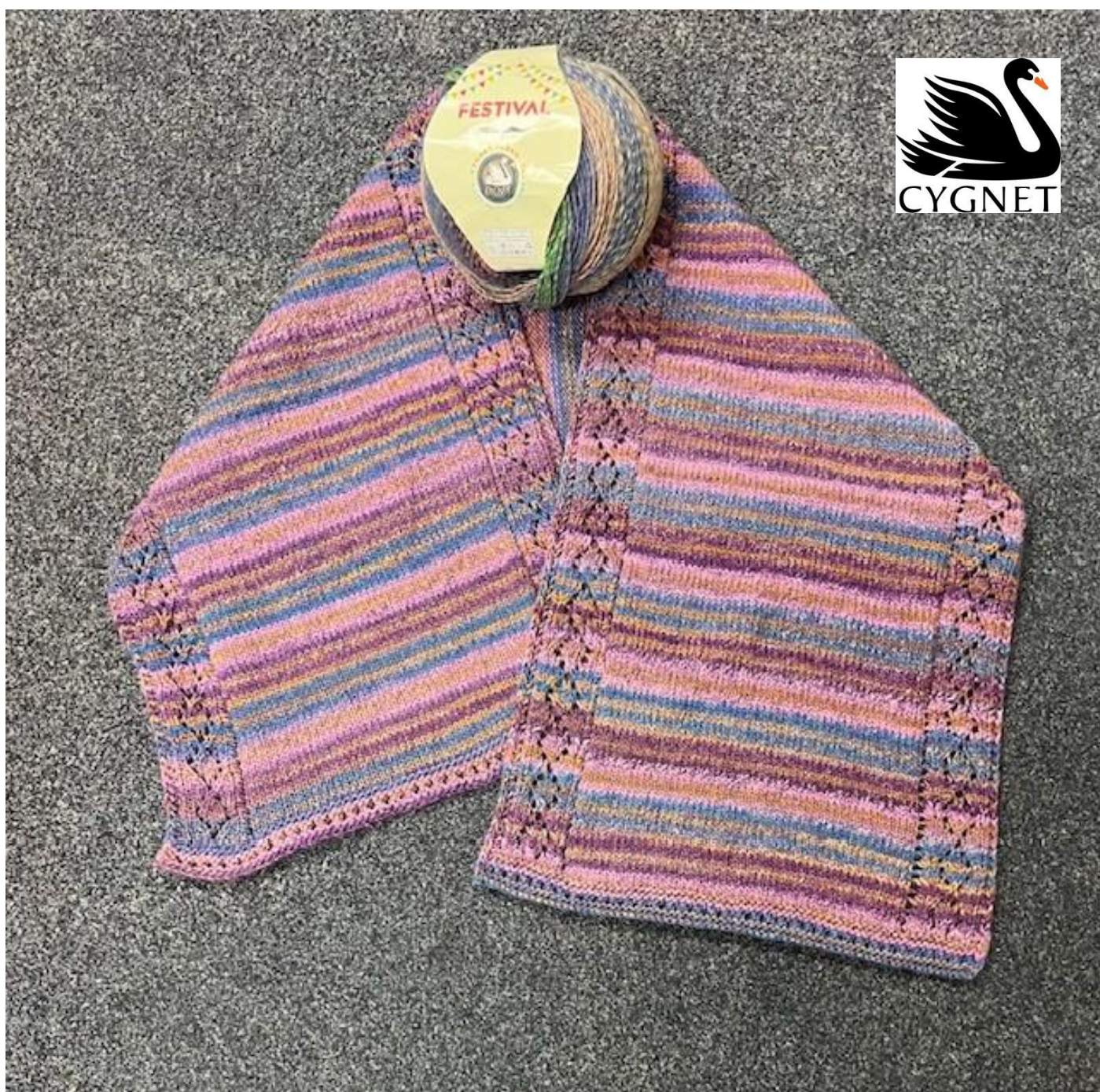
CY1957 FESTIVAL CLIMBING DIAMONDS WRAP