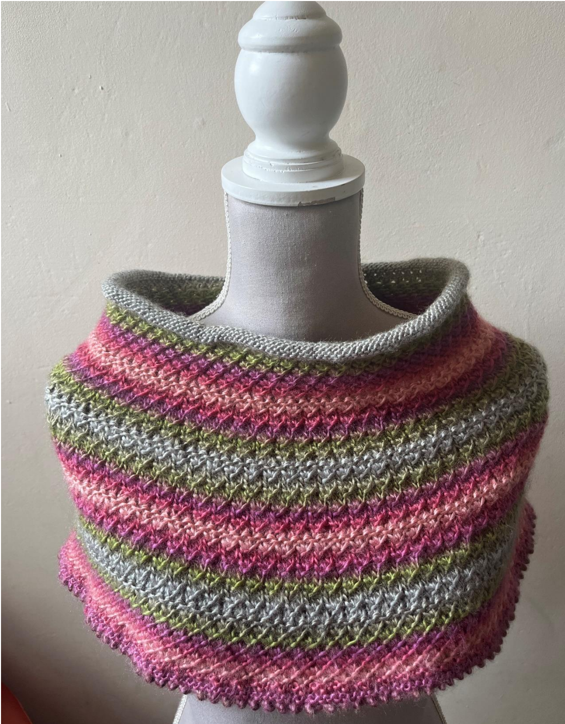
CY1832 BOHO SPIRIT GATHERED COWL