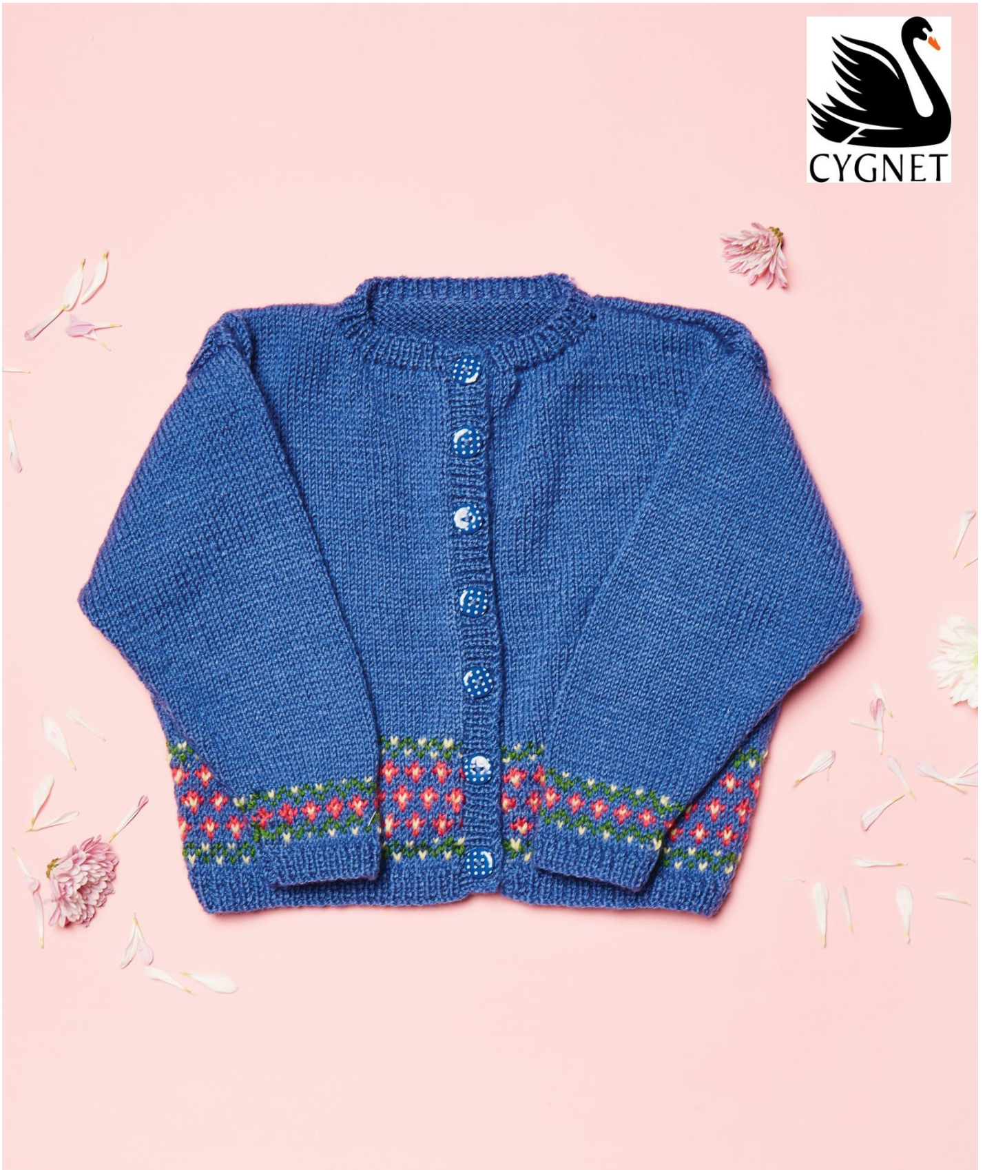
CY1445 Kiddies Supersoft DK Cornflower Cardigan Sizes 1-5 years