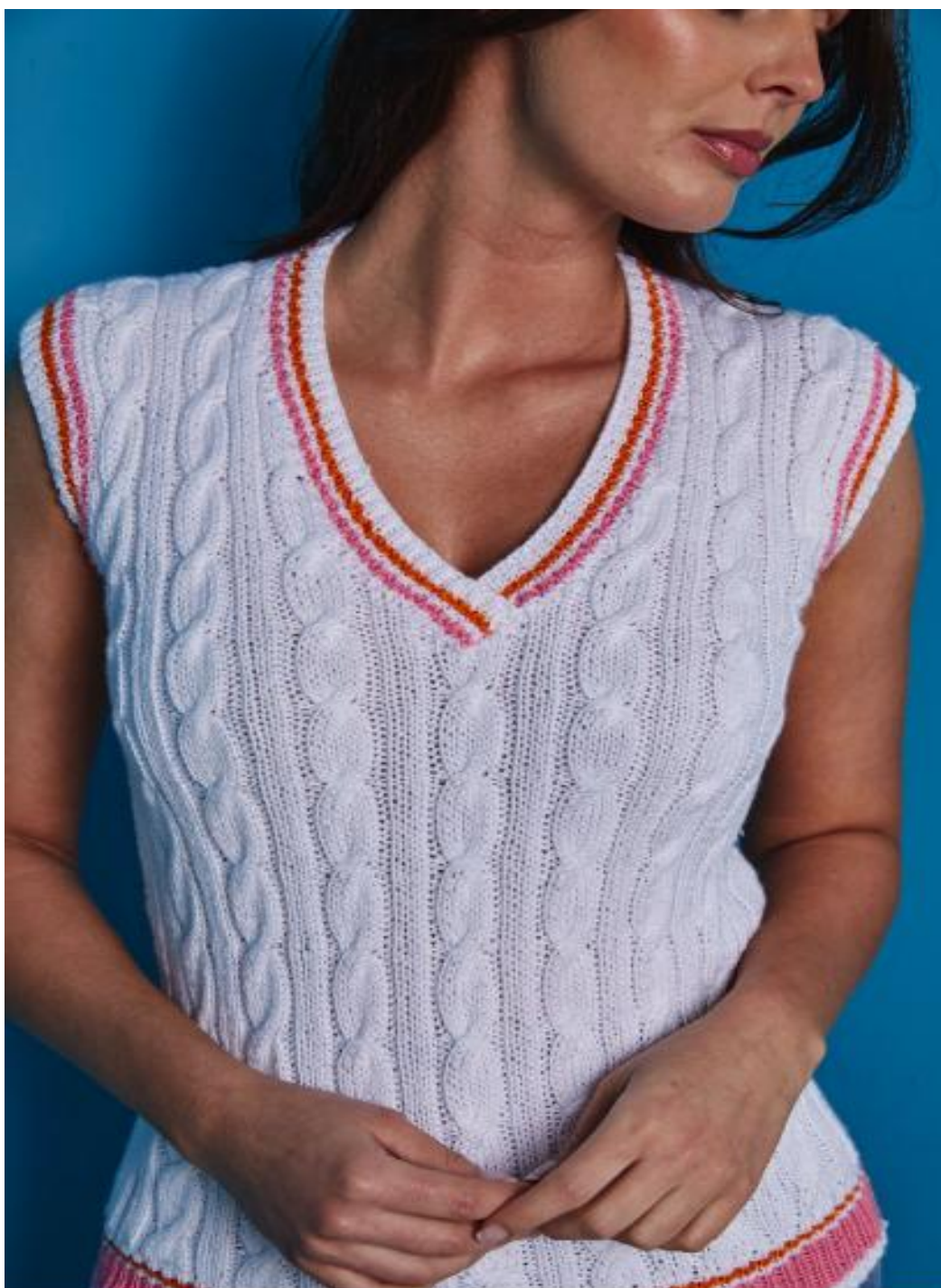
CY1916 CABLED SLIPOVER CYGNET DK