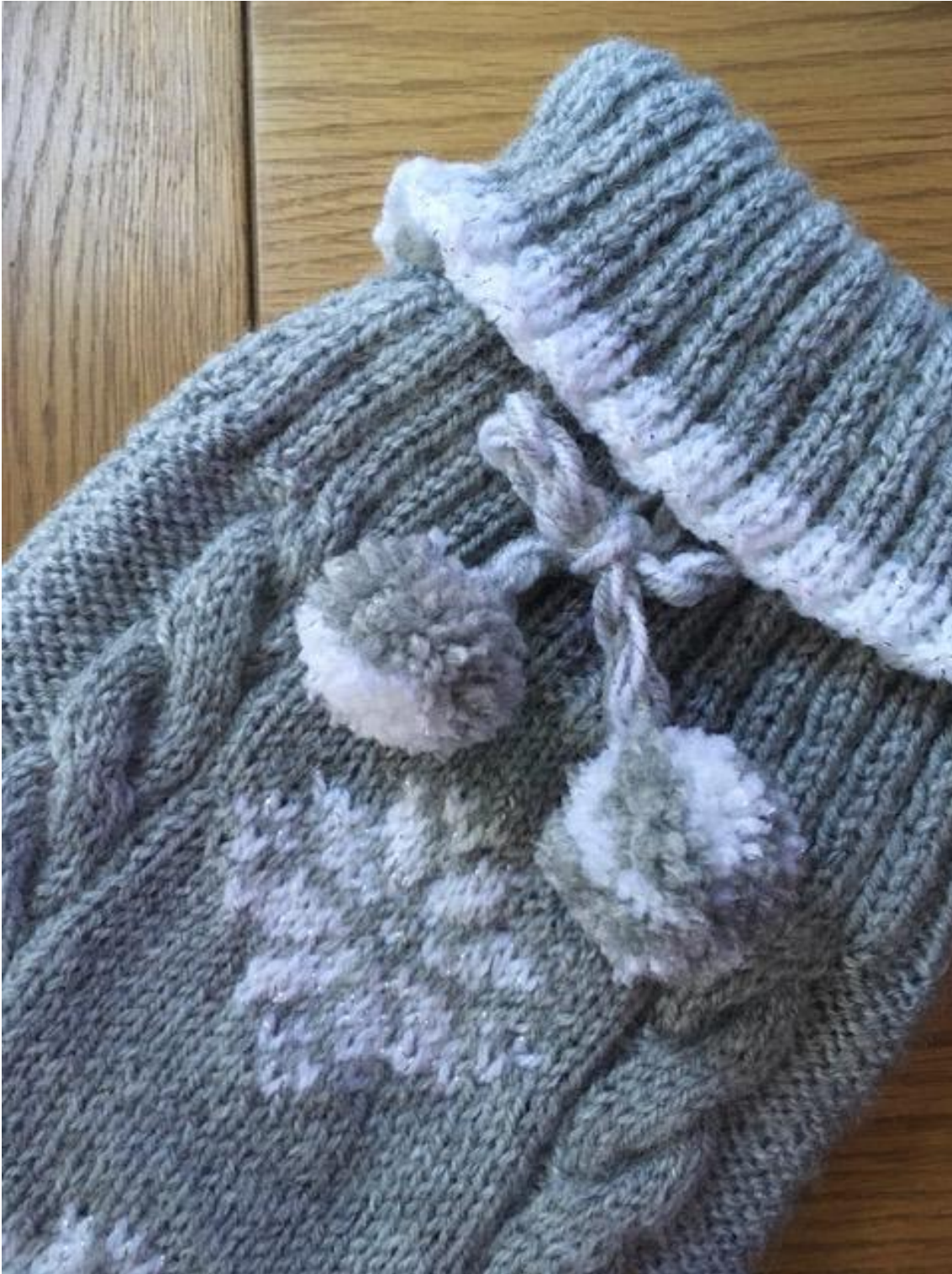
CY1272 Cygnet DK & Glittery DK Snow Flake Hot water Bottle Cover