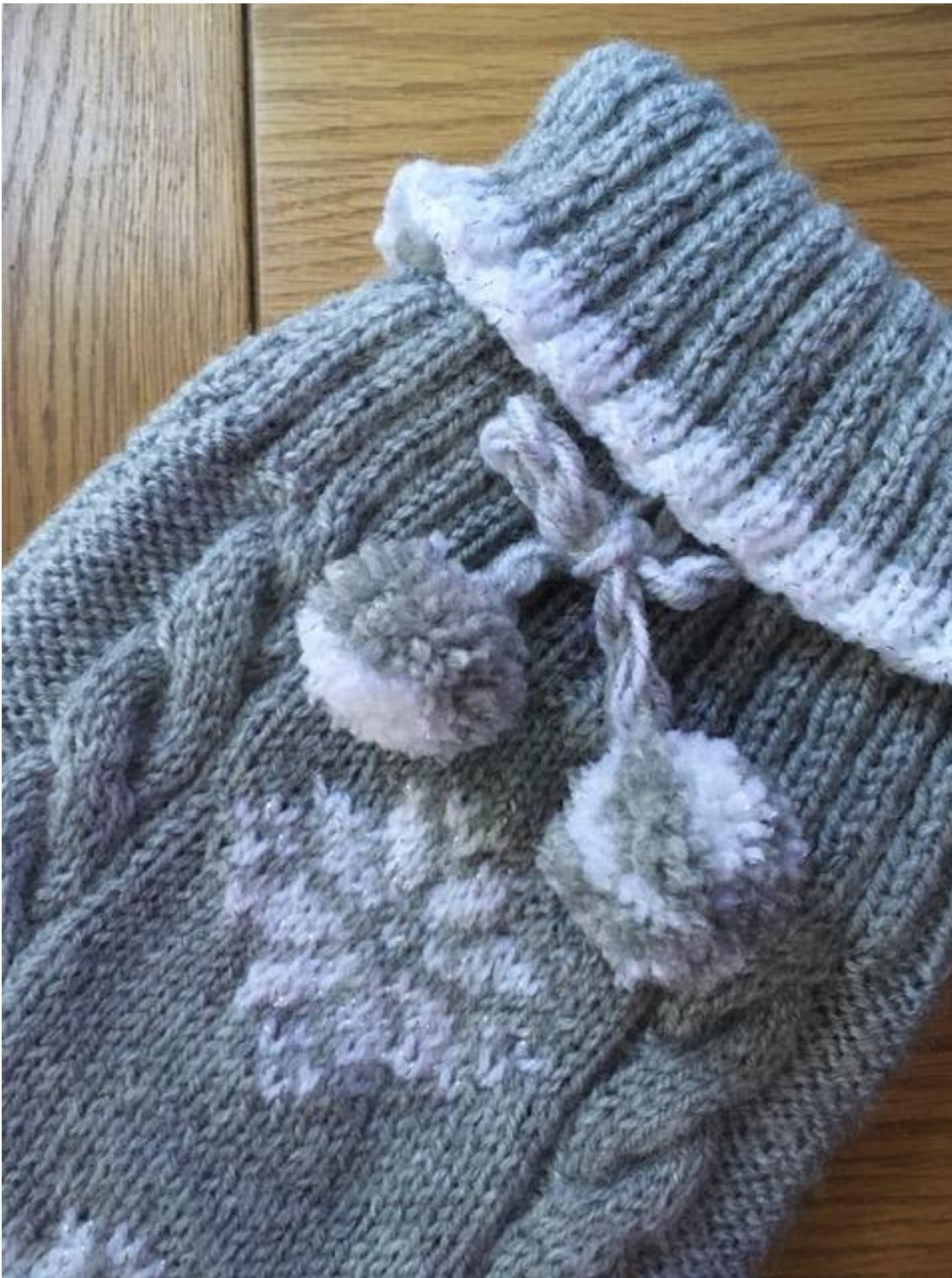
CY1272 Cygnet DK & Glittery DK Snow Flake Hot water Bottle Cover