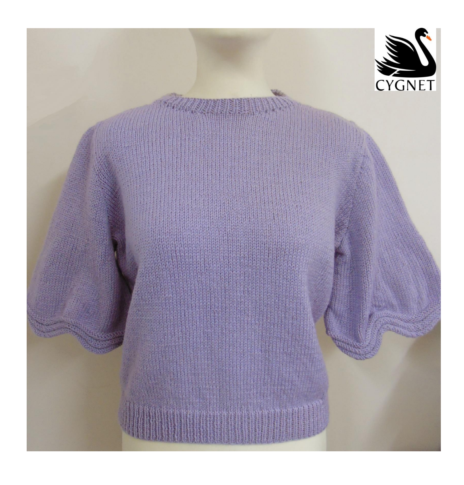
CY1062 Cygnet Pure Wool Superwash DK Lavender Chevron Sleeve Sweater