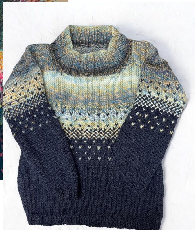
CY1830 Sprinkles Pop Chunky Sweater